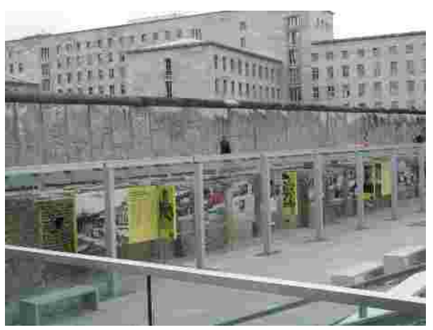
The Berlin Wall