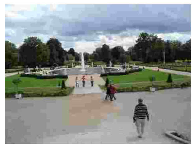
Sans Souci – One of the gardens