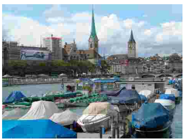
Zurich from Lake Zurich