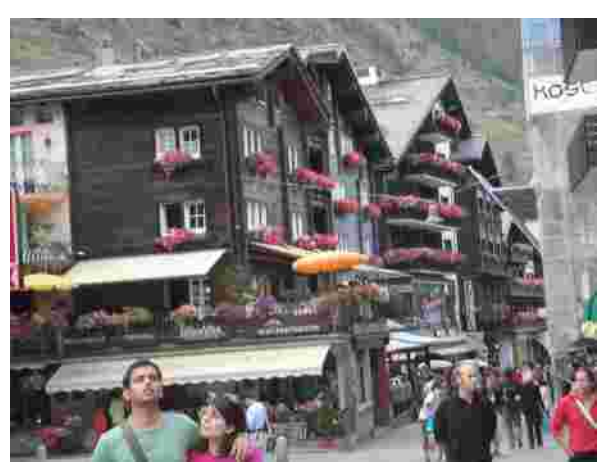
City of Zermatt