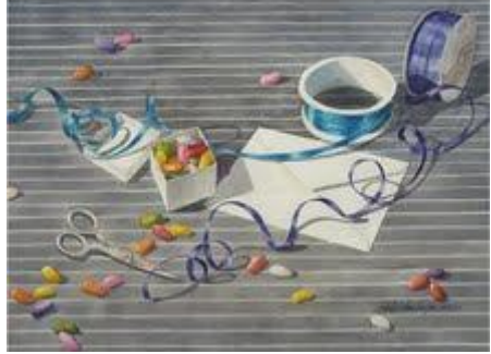
And a Box Full of Beans