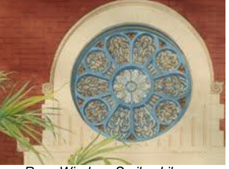
Rose Window, Smiley Library