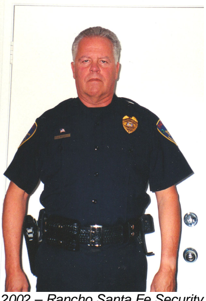
2002 – Rancho Santa Fe Security

I was later employed by the Rancho Santa Fe Association, along with nine other officers, to patrol and maintain security for one of the wealthiest communities in the U.S. Our department was charged with protecting the residents who were mostly comprised of celebrities, sports figures and notable political personalities. My security career recently ended on April 18th, 2009 when I elected to retire from the Association.