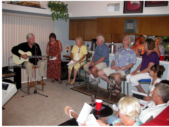
Kiowa Reunion Committee