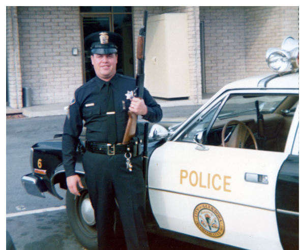
1984 – Glendora Police Department

For a while I worked with the Southern Pacific Railroad as a brakeman and then enrolled at Pasadena City College where I studied Police Sciences. Upon graduation I was hired by the City of Glendora and sworn in as an Officer on April 2nd, 1969. I later attended and graduated from the L.A. County Sheriff's Academy and was assigned to the Patrol Division where I worked as a patrolman for a couple of years.