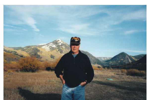
2003 - Green River fishing trip

You can read this bio and all previous alumni bios at <a href="http://www.azusahighschool1961.com/Pages/bios.html">http://www.azusahighschool1961.com/Pages/bios.html</a>