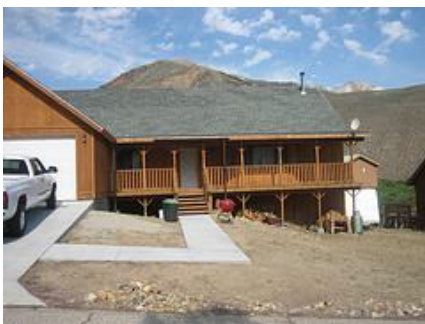
Sierra Nevada Home