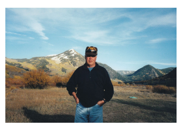
2003 – Green River fishing trip

You can read this bio and all previous alumni bios at http://www.azusahighschool1961.com/Pages/bios.html