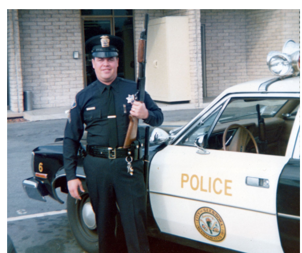
1984 – Glendora Police Department

For a while I worked with the Southern Pacific Railroad as a brakeman and then enrolled at Pasadena City College where I studied Police Sciences. Upon graduation I was hired by the City of Glendora and sworn in as an Officer on April 2nd, 1969. I later attended and graduated from the L.A. County Sheriff's Academy and was assigned to the Patrol Division where I worked as a patrolman for a couple of years.