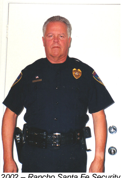
2002 – Rancho Santa Fe Security

I was later employed by the Rancho Santa Fe Association, along with nine other officers, to patrol and maintain security for one of the wealthiest communities in the U.S. Our department was charged with protecting the residents who were mostly comprised of celebrities, sports figures and notable political personalities. My security career recently ended on April 18th, 2009 when I elected to retire from the Association.